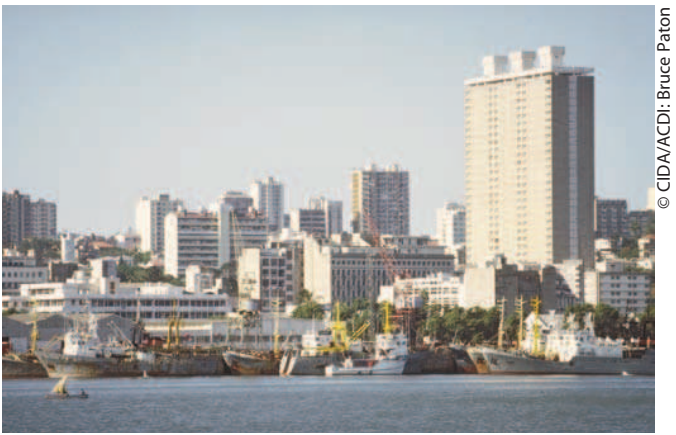
Maputo, the capital of Mozambique.