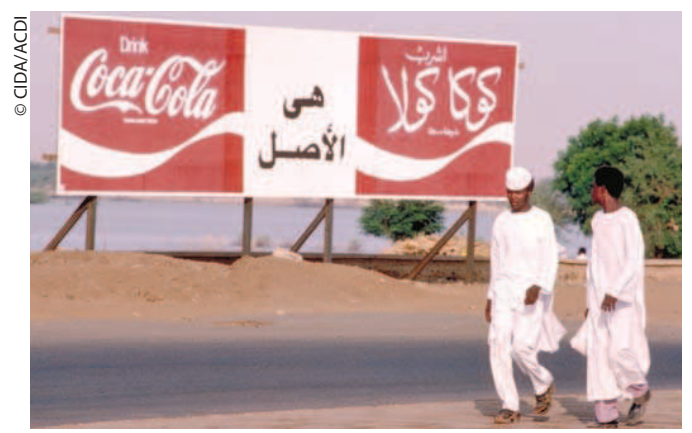
In the Sudan.