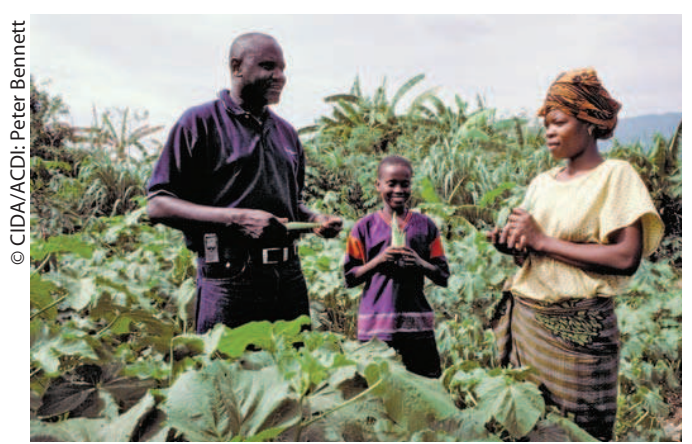
On a farm in Tanzania.